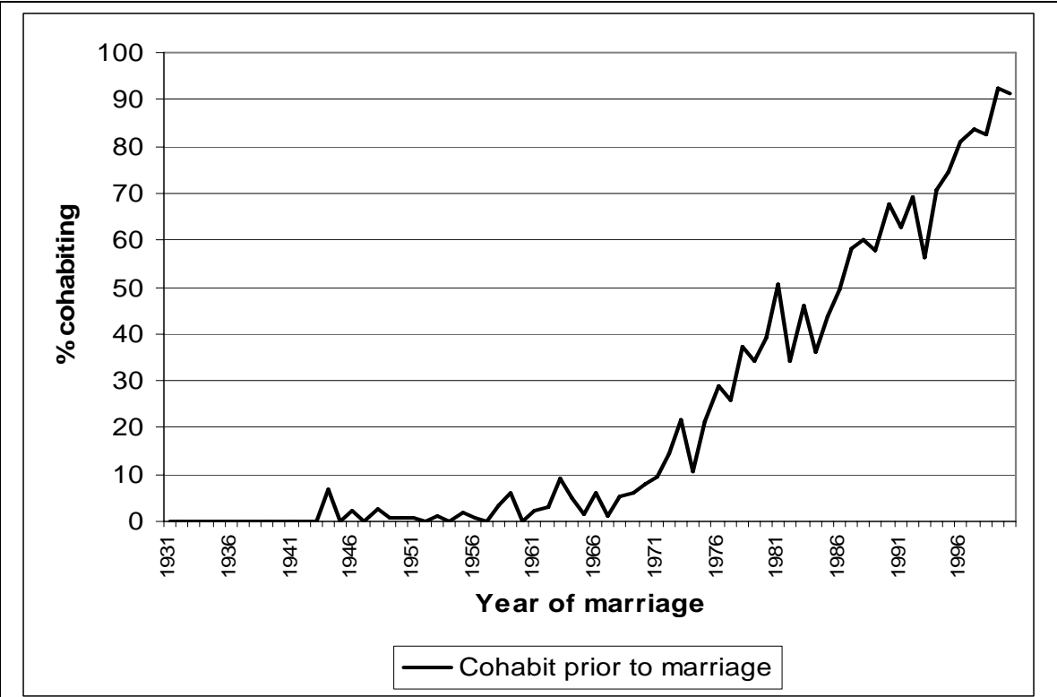
Figure 1: Proportion of sample who report cohabiting prior to marriage 1931 – 2000 (source HILDA 2001)