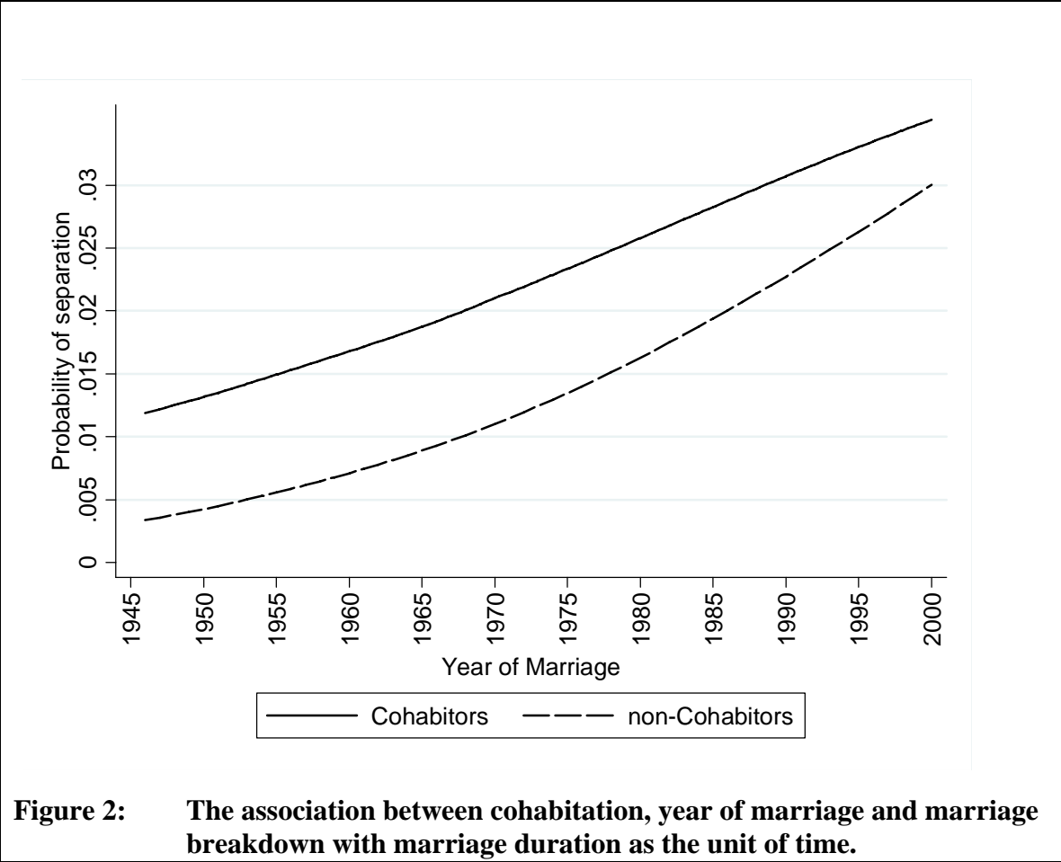
Figure 2: The association between cohabitation, year of marriage and marriage breakdown with marriage duration as the unit of time.