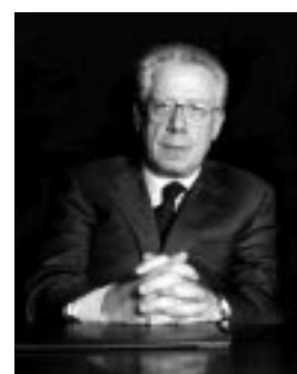
Dr Tommaso Padoa-Schioppa

A meeting of the European Regional Committee of IOSCO, the International Organization of Securities Commissions, took place at the EUI on 24 April 1998. The meeting was organized by the Commissione Nazionale per le società e la Borsa (CONSOB) and was chaired by Dr TOMMASO PADOA-SCHIOPPA.