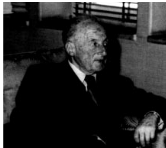
Etienne Hirsch (1901-1994)

Dès 1945, ETIENNE HIRSCH assiste JEAN MONNET dans les préparatifs du Commissariat français au Plan de modernisation et d'équipement. A sa création, il est appelé à la tête de la Division technique avant de devenir commissaire général adjoint. Parallèlement il prend part aux manœuvres diplomatiques destinées à changer le cadre politique du continent. La rue de Martignac en est naturellement le foyer. En avril 1950, il participe à la rédaction de la déclaration Schuman qui annonce l'une des 'premières assises concrètes d'une fédération européenne indispensable à la préservation de la paix'.