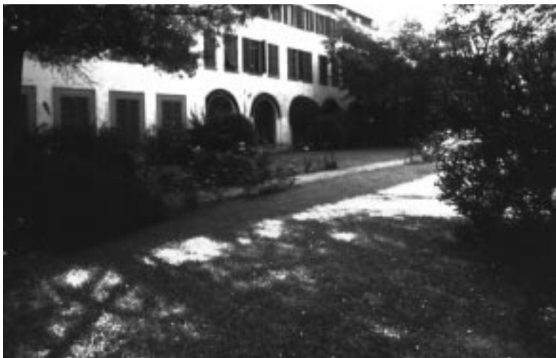
The Library wing of the Badia Fiesolana

Documents services comprise on-demand acquisition of works needed for research, open access to the collections (more than 50,000 in-house consultations yearly), loans (40,000 per year) and Interlibrary Loan and Document delivery from outside sources: libraries and document sup-