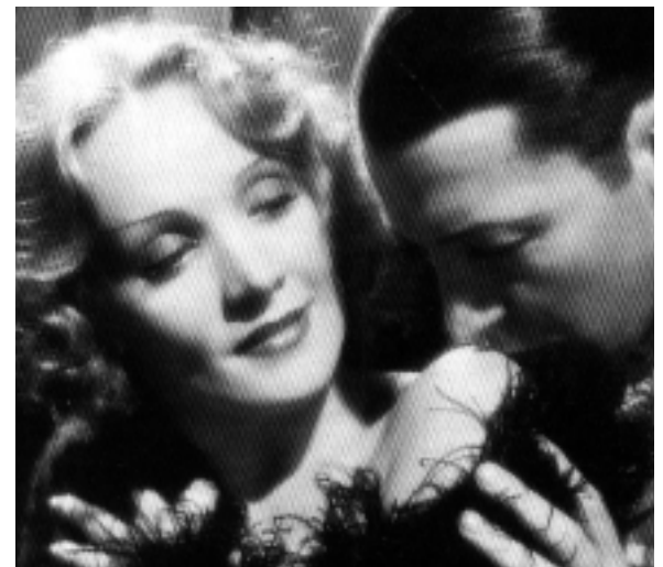
Marlene Dietrich and Clive Brook in Shanghai Express (1932)

The coming of sound film in 1928 initially gave the European industries an advantage, as Europeans preferred to watch films in their mother tongue. But once the Hollywood studios had mastered dubbing and subtitling this advantage quickly diminished to a small niche in the domestic market. The strong rise in production costs caused by sound technology made this niche difficult to maintain, and in the early 1930s the European film industry was back where it was in the early 1920s. In France the two biggest companies, Pathé and Gaumont, both went into receivership.