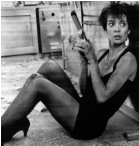
Anne Parrillaud in Luc Besson's Nikita (1990)

In the early 1990s, Polygram re-entered the film business, this time not concentrating on film production, but aiming to build an international distribution organization. It distributed feature films for cinemas, as well as television programmes and videotapes. The distribution machine was fed by films from a variety of production companies, comparable with 'labels' in the music industry. These were based in Britain, France and the US, and were often only partly owned by Polygram, to spread production risk. Polygram also started to buy up rights to catalogues of old films and television pro-