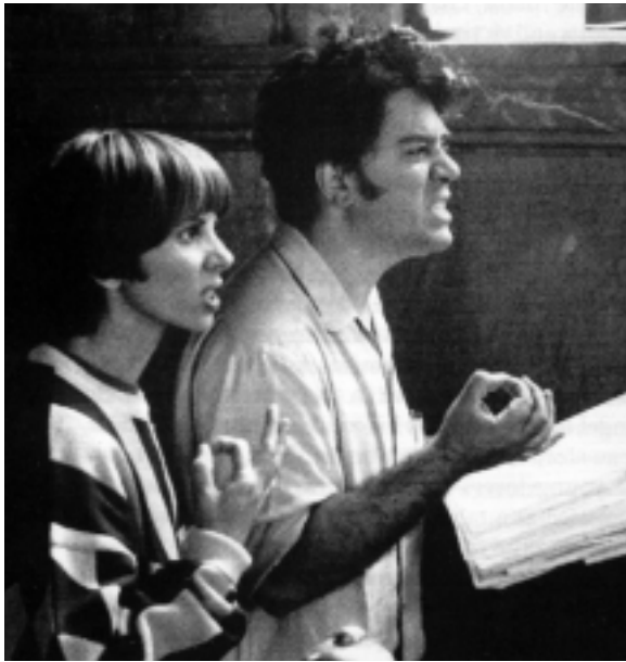
Pedro Almodóvar directing Victoria Abril in Tacones lejanos (1991)

Will Europeans ever again enjoy the situation depicted at the outset of this article, with a strong European mass-entertainment industry? Recently, European companies have been successful in some niche markets.