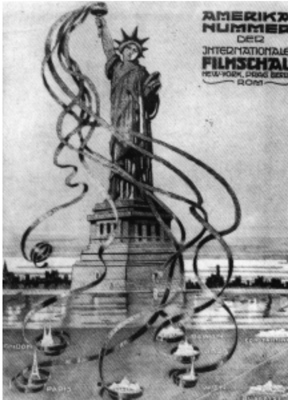
Cover of Internationale Filmschau , 1 June 1921

went bankrupt. Nordisk continued as an insignificant Danish film company, and eventually went into receivership. The eleven largest Italian film producers formed a trust, which failed terribly, and one by one they fell into financial disaster. In the United Kingdom, no British films at all were being made by late 1924.