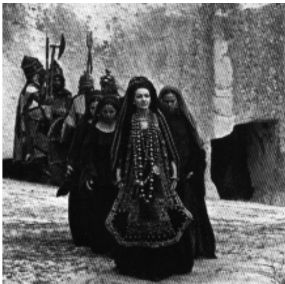
Maria Callas in Pier Paolo Pasolini's Medea (1970)

One member of the MEDIA program claimed that about a third of the funds were used for administrative expenses, such as staff salaries, promotional material, meetings in expensive hotels, airline tickets, etc. Optimists commented that for a European subsidy programme, this might be quite a low percentage.