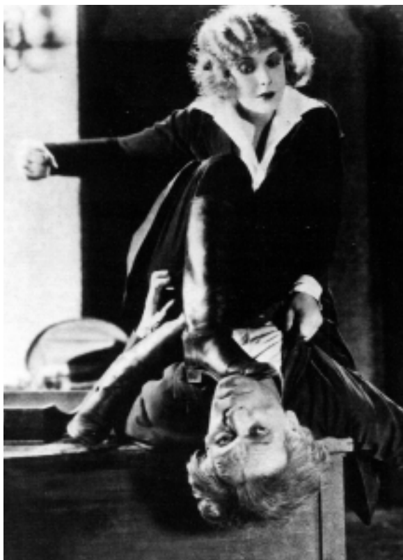
Pearl White in Plunder (1923)

This may seem science fiction, but it is actually the past. In the first decades of the last century, European films were hugely popular in the United States. Euro-