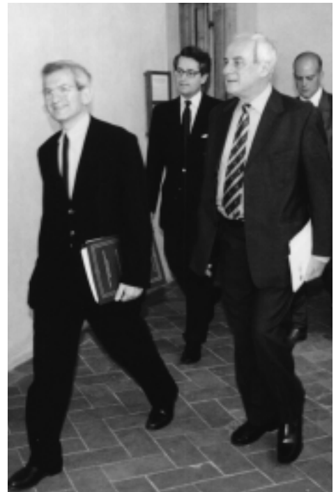
Luciano Violante arriving at the Badia Fiesolana