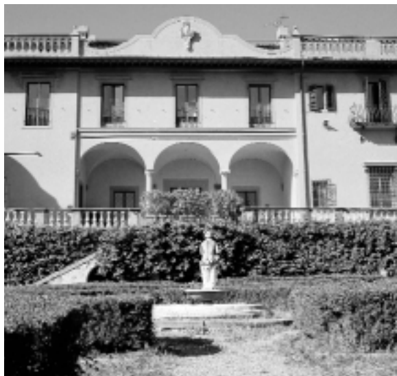
Villa Schifanoia, in der die Juristen „untergebracht“ sind

Die deutschen Universitäten und ihre Professoren stehen im europäischen Vergleich gut da. Aber die Privilegien, die das Europäische Hochschulinstitut bietet, erscheinen unerhört: Erwartet wird vor allem Forschung, möglichst in interdisziplinärer und internationaler Zusammenarbeit. Die Lehrverpflichtung beschränkt sich auf ein Seminar. Betreut werden handverlesene und hoch motivierte Graduierte. Solche Daten klingen fast unwirklich. Ihr Glanz verblaßt im tagtäglichen Anfall einer Unsumme von Erledigungen ein wenig: Die insgesamt etwa 130 Doktoranden und