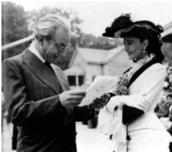
Alexander Korda and Vivien Leigh

port. Despite some blockbuster period dramas, such as The Private Life of Henry VIII and Don Juan (interestingly, not produced by a Brit, but by a Jewish-Hungarian immigrant) the success was not consistent. After a