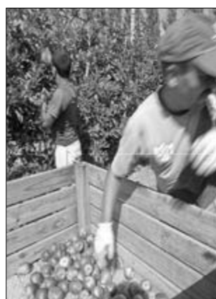
Doing jobs locals do not want

Spain is a case in point. While it had about five workers to support each elderly person in 1992, now it has just under four. And, while there are signs that immigration has slowed since 2008, the foreign population of Spain has roughly tripled to just under 6m over the past 12 years.