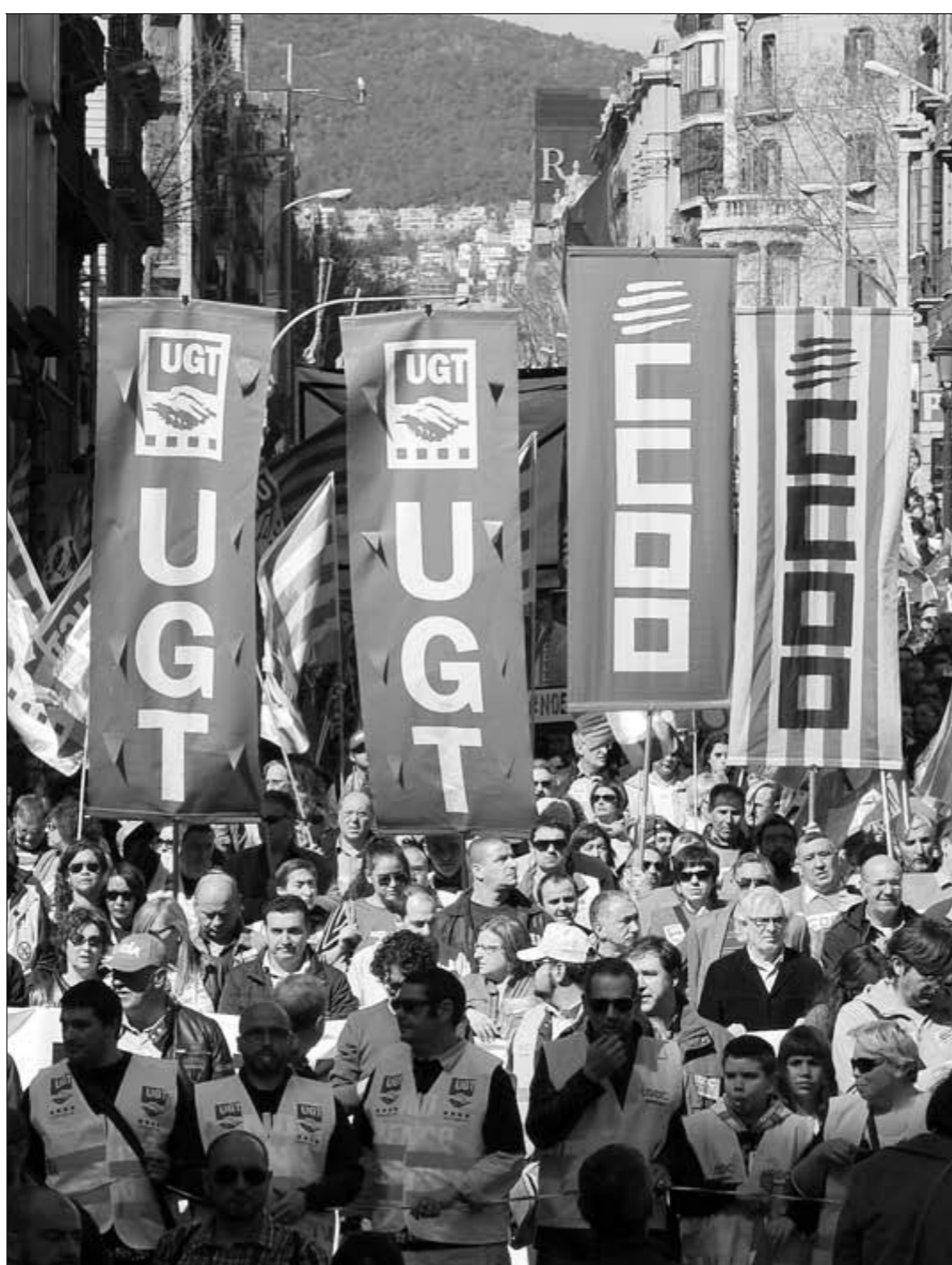
Demonstrably upset: Spain's high jobless rate has led to mass protests

Liberalisation of labour markets has enabled Greece to close the cost-competitiveness gap with other southern eurozone countries by about 50 per cent over the past two years. Most of this has come from wage cuts but business confidence has jumped. Opening up product and service