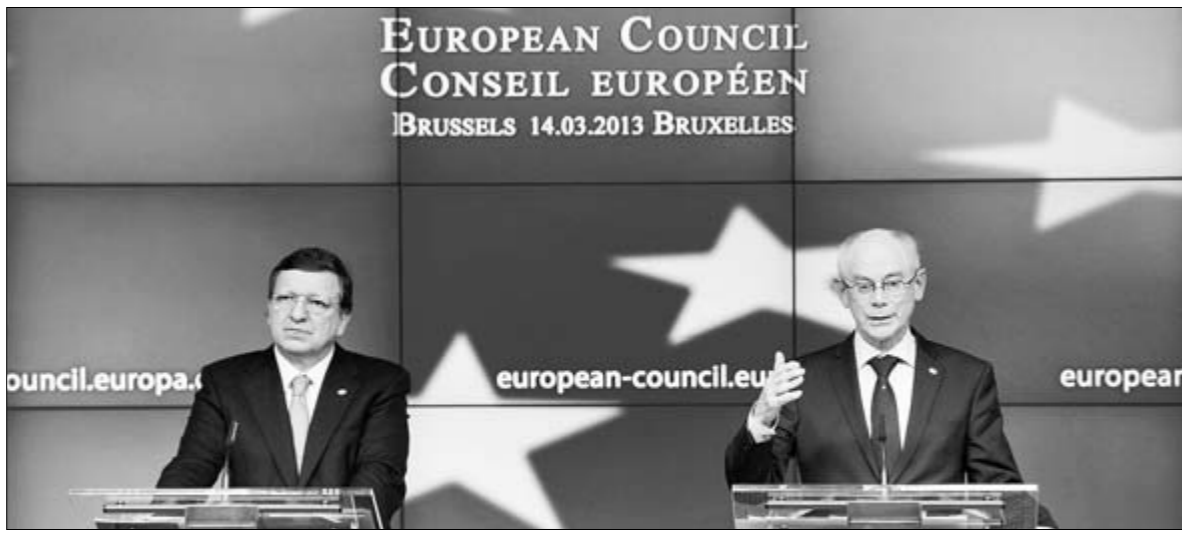
Scuppered: José Manuel Barroso and Herman Van Rompuy's detailed plans for a new eurozone budget were gutted by members

In the waning days of 2012, the EU's two presidents issued ambitious reports setting out a multi-year timetable for transforming the eurozone from a loosely-coordinated group of economies into a far more federal system with centralised fiscal control from Brussels. Although the blueprints issued by José Manuel Barroso, the European Commission president, and Herman Van Rompuy, his European Council counterpart, differed in their details, both shared a common goal: creating an embryonic eurozone budget that could eventually evolve to a US-style federal treasury with the power to tax, spend and raise debt. "There are still important challenges to the... existence of economic and monetary union," Mr Barroso said when he unveiled his plan. "We must counter this crisis of confidence by showing we are ready to strengthen co-operation and integration."