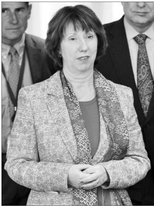
Balkan success: Catherine Ashton, foreign policy chief

In relations with Russia, EU member states have