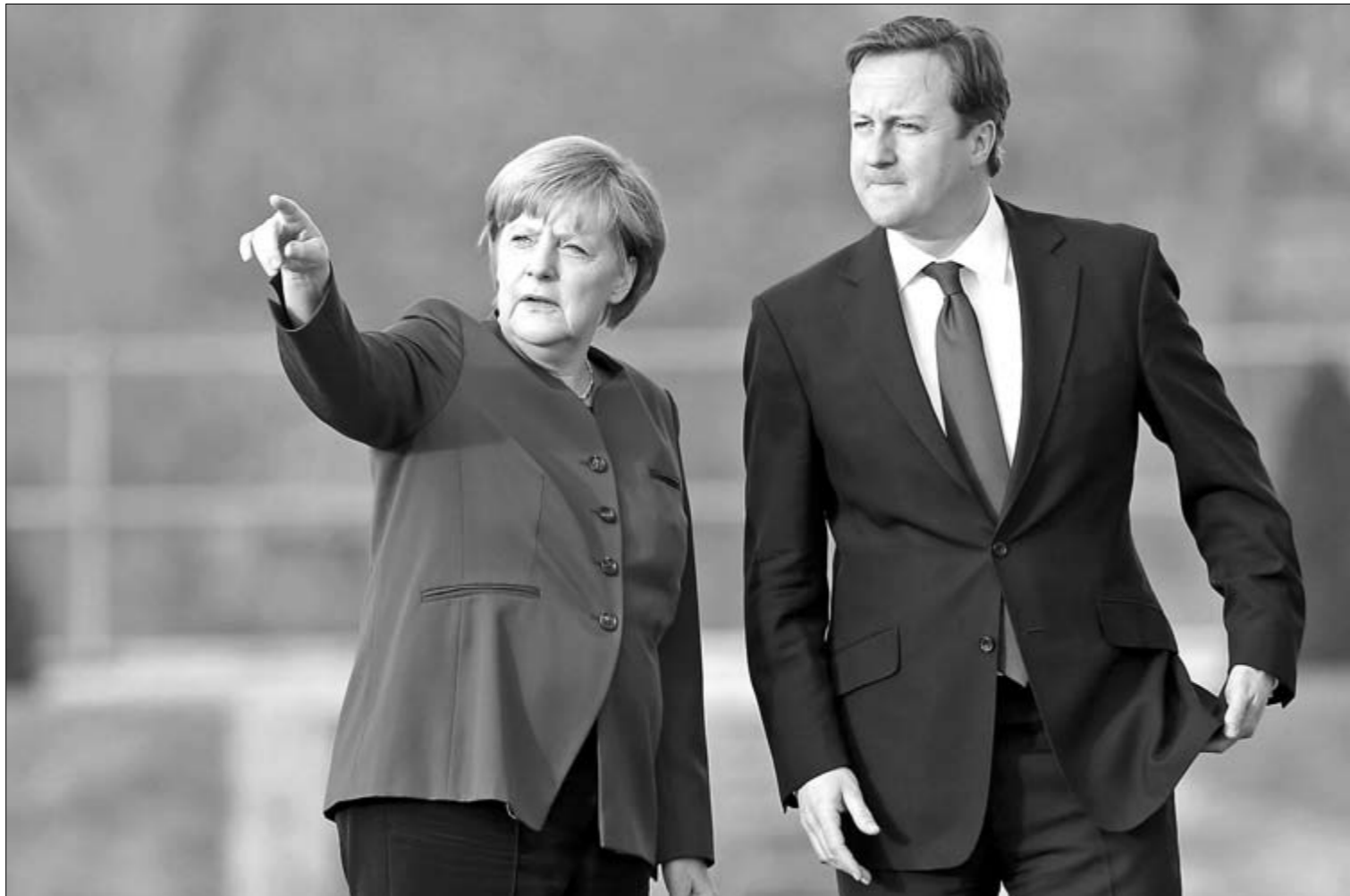
Long view: David Cameron, UK prime minister, and Angela Merkel, German chancellor

Even if Mr Cameron was able to deliver his referendum, he has promised to campaign for Britain to stay in the EU – albeit on the big proviso that he is able to secure improved terms of