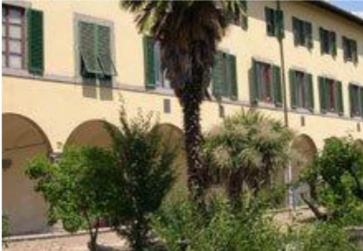
Il Convento di San Domenico