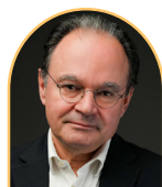
Georgios Papakonstantinou EUI Professor of International Political Economy, former Greek Finance Minister