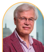
Bengt Holmström 2016 Nobel Prize Laureate in Economics