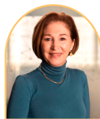
Anne Marie Slaughter Former Director of Policy Planning, US Department of State