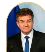
Miroslav Lajčák EU Special Representative for the Belgrade-Pristina Dialogue and other Western Balkan regional issues