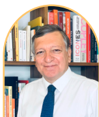
José Manuel Barroso Former President of the European Commission