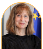
Catharina Sikow-Magny Former Director of Green Transition and Energy System Integration at the European Commission