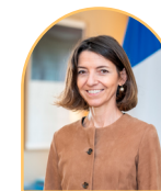
Laurence Boone Former French Minister of State for European Affairs