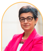
Arancha Gonzales Laya Former Foreign Minister of Spain